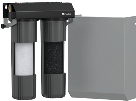
WH2-55 20" Dual Water Filter System